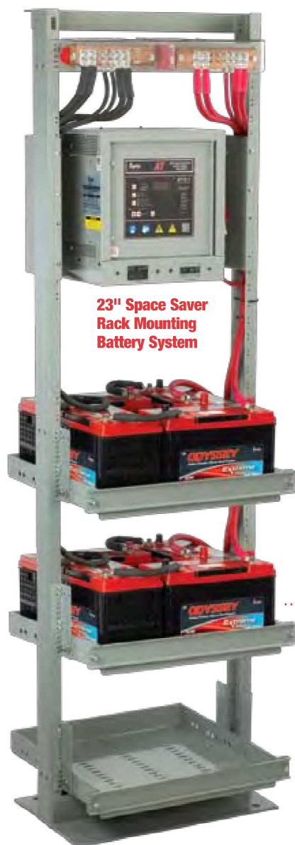
23" Space Saver Rack Mounting Battery System