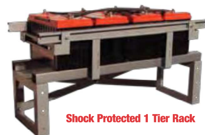
Shock Protected 1 Tier Rack