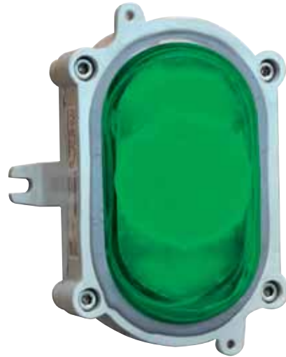
Green LED Version