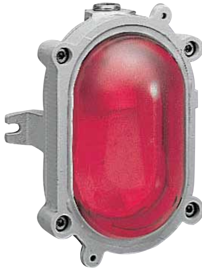
Compact Fluorescent Painted Glass Version